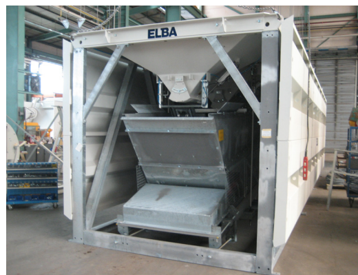
RD ready for dispatch