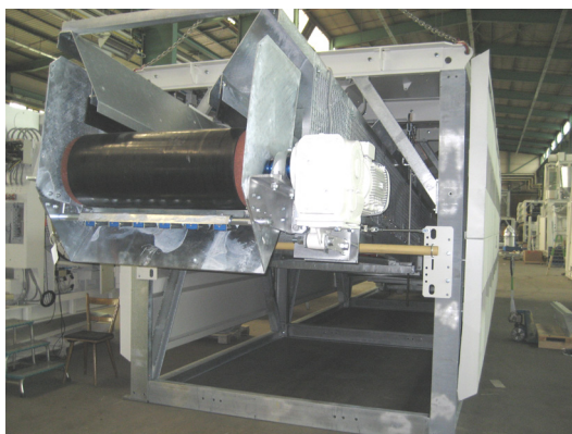
RD in final assembly