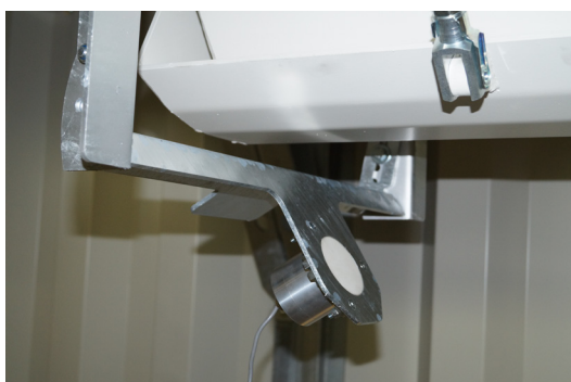
Illustration shows option: Sand moisture measuring device